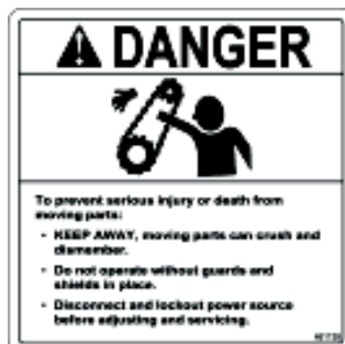
C. DANGER - Do Not Operate without Guards. Sign Number 461139.