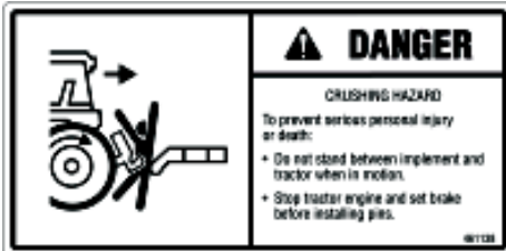
C. DANGER - Crushing Hazard Sign Number 461138