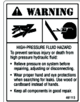
B. WARNING - High pressure Fluid Hazard Sign Number 461113