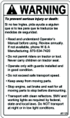
A. WARNING - Operator's Manual Sign Number 461123